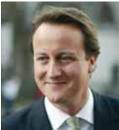
David Cameron Leader of Conservative Party

This year marks twenty years since the fall of the Berlin Wall – twenty years since the momentous events that brought the Iron Curtain crashing to the ground and ended the division of Europe.